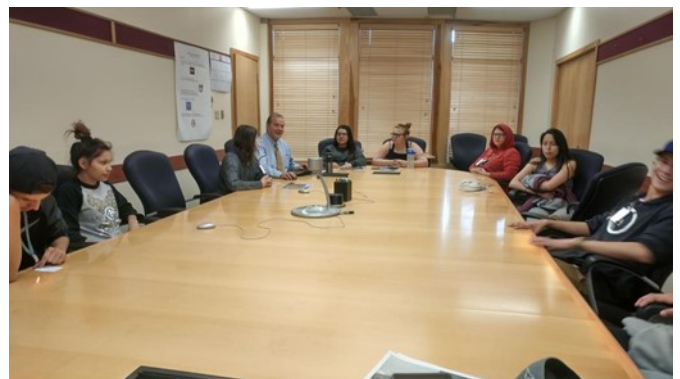
Experiencing the boardroom.