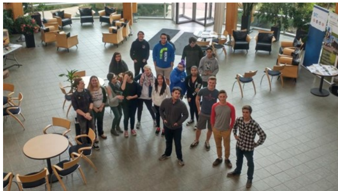
Checking out the display area.