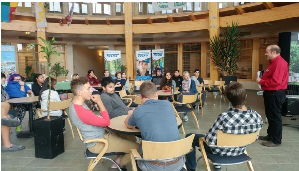
Students learn about National Forest Week and careers in forestry.