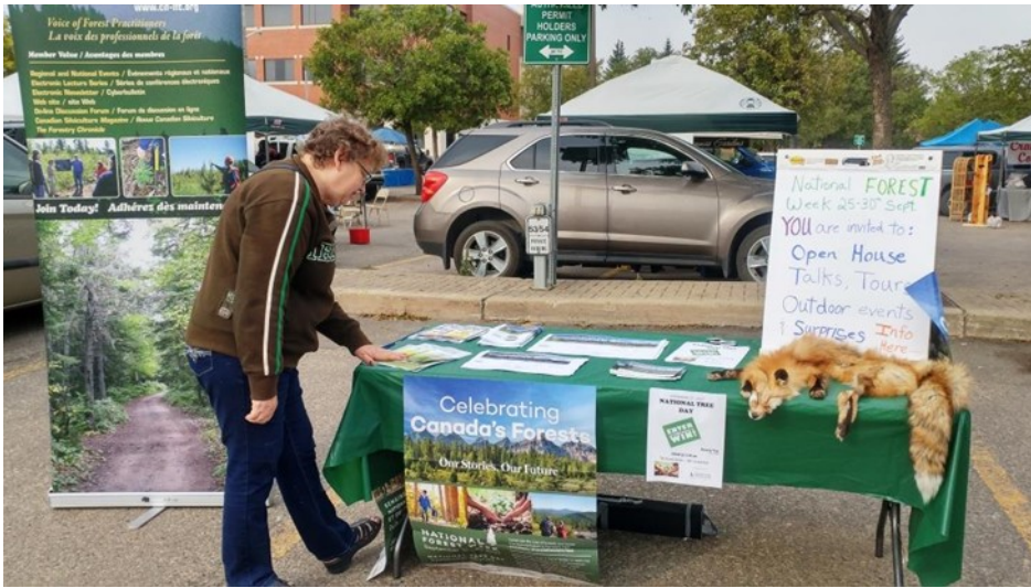
Advertising for National Forest Week at the Farmers' Market.